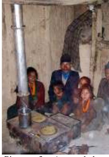
Picture 3: A smokeless metal stove installed. providing good warmth during the cold seasons.

technologies. Generating and storing energy through the rich solar energy resource, powering appropriate and sustainable lights, brings potential health, education, social and economic benefits to the people who lived previously in homes with excessive indoor air pollution. In order to come up with a sustainable lighting solution one has again first to understand how the local people till now have fulfilled their need for light. During the workshop an appropriate and now in many households in the remote Karnali zone already successfully implemented elementary rural village electrification solution for indoor lighting purpose, is presented and discussed. Through solar PV technology with WLED white light emitting diode lamps (see pictures 6-8), or called WLED lamps, hundreds of people in upper Humla enjoy now daily some minimal lighting services. Most of the equipment are developed and manufactured in Nepal, creating valuable jobs and income, and teaching local people new skills. Some recently implemented projects in Humla are highlighted and can build the basis of further discussions.