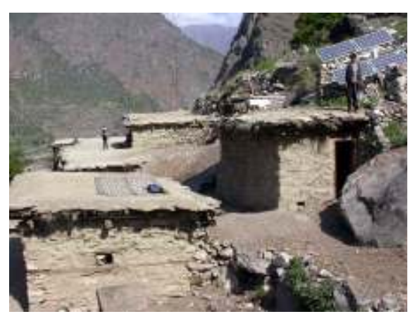
Picture 8: A central village solar PV system with 300 W<sub>R</sub> for 63 homes and a total of 189 WLEDs for each 5 hours light in each home. That is the Chauganphaya village's lighting option now since January 2004.