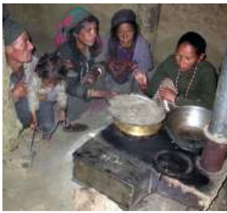
Picture 4: The high altitude Picture 5: One project staff is teaching a family how to use the new smokeless metal stove. It has also a stainless steel water tank for 9 liter drinking water, ideal also for washing and clean the kids.