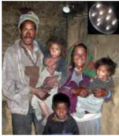
Picture 7: Now the families can grow up with clean indoor air and enable their kids to study in the evening with light.