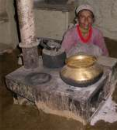
smokeless metal stove allows to cook the traditional "dhal bhat" all at one time, saving up to 50% fire wood. It cooks easily for up to 12 people.